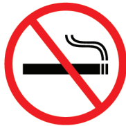
cardiorespiratory disease prevention such as smoking cessation